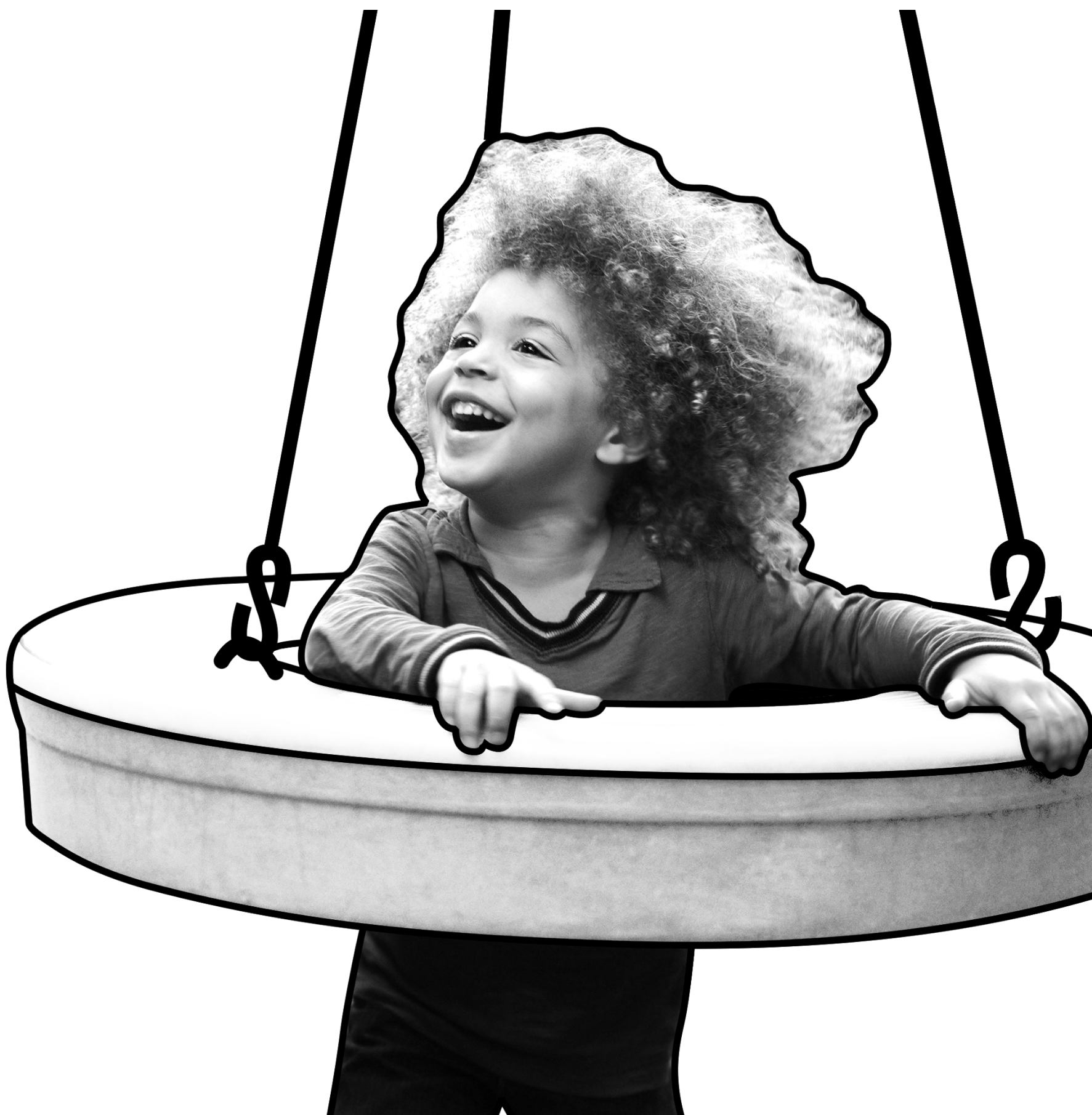
Image shows a smiling child in a tyre swing.